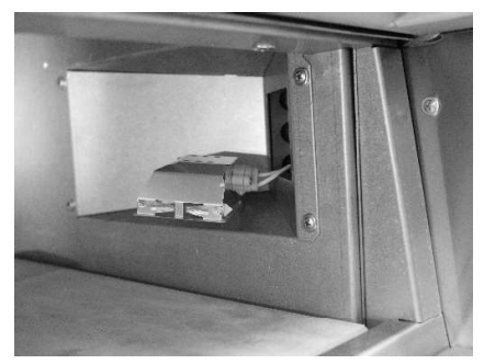
5. Leave the lamp over the frame