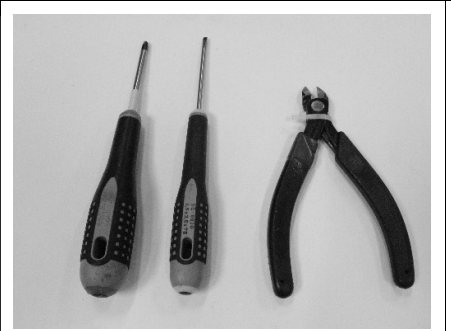
1. Use these tools to replace the lamp socket. A Phillips screwdriver, a flat screwdriver and a wire cutter