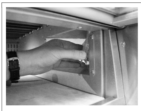
1. Remove the glass