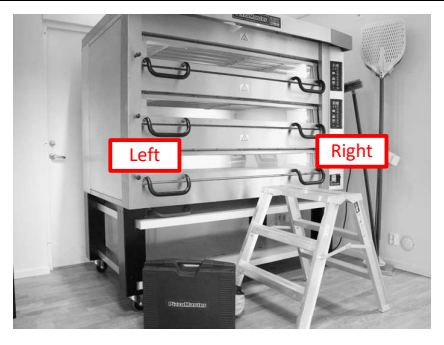
6. Follow "STEPS A" only if the lamp is at the left-hand side, and "STEPS B" only if the lamp is at the right hand side