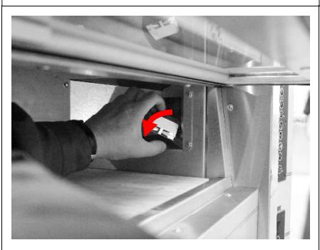
4. Remove the lamp holder by pulling it from the top